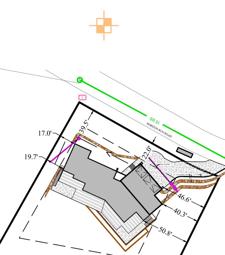
VICINITY MAP: 1:50