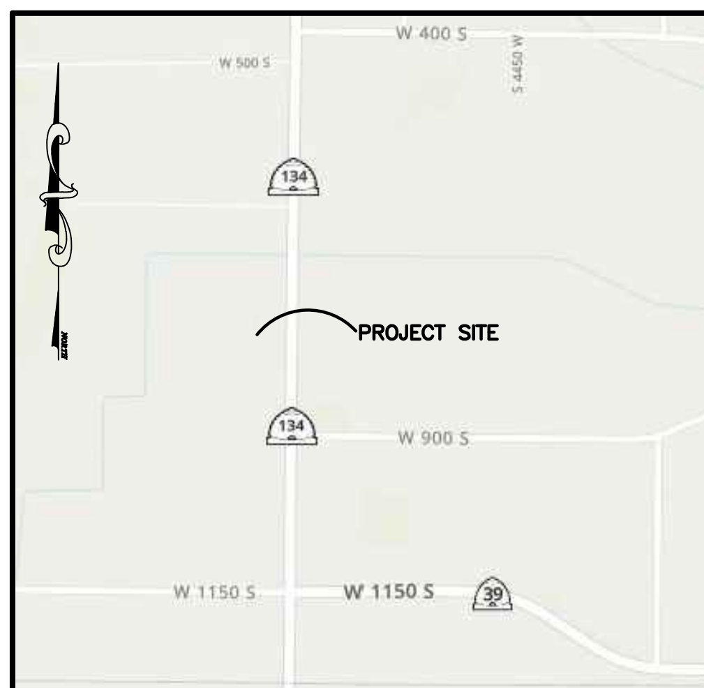
VICINITY MAP SCALE: NONE