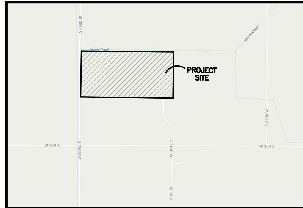
VICINITY MAP NO SCALE