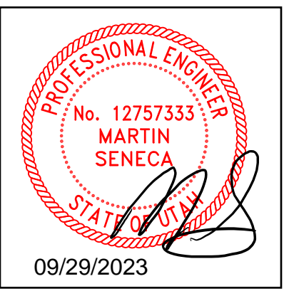
Professional Engineer Seal