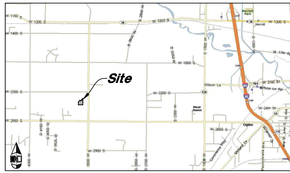
VICINITY MAP (Not to Scale)

A part of the Southeast Quarter of Section 28, T6N, R2W, SLB&M, U.S. Survey Weber County, Utah July 2022