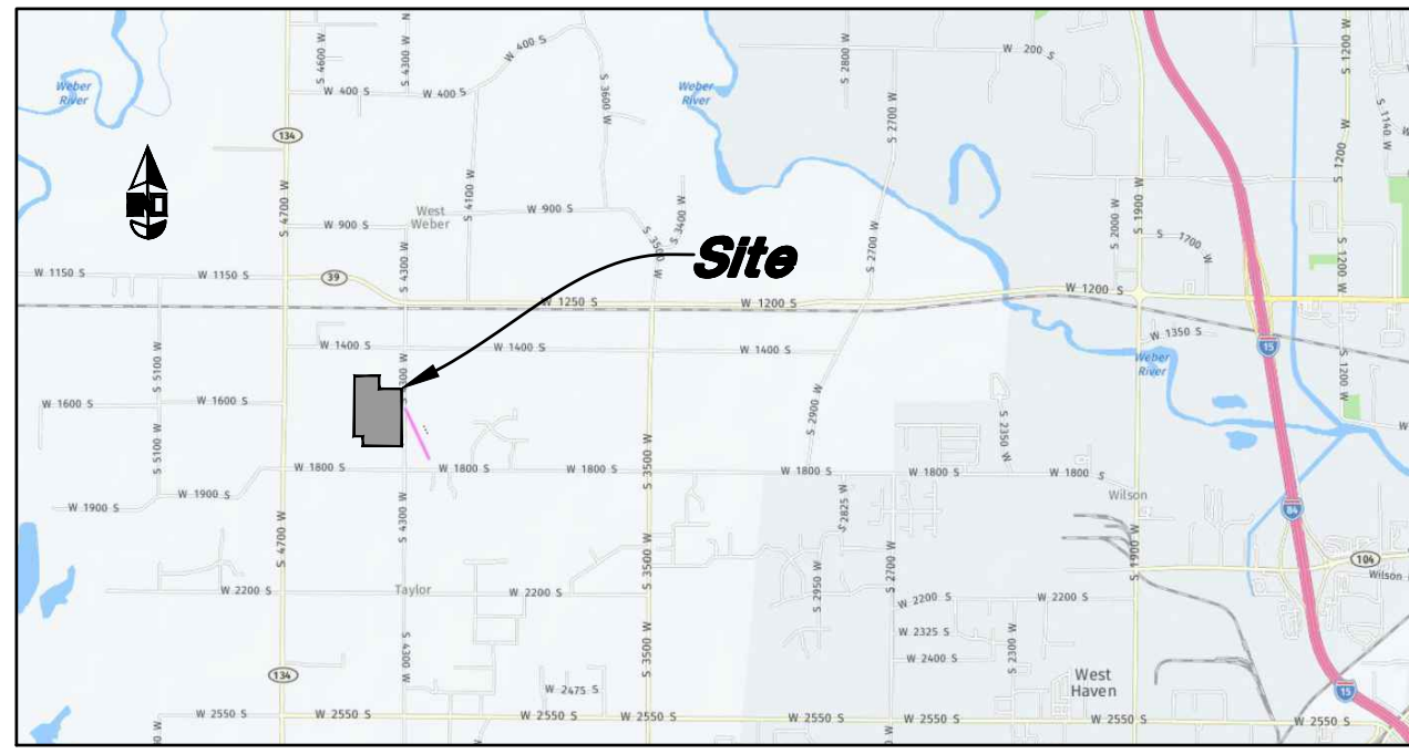
VICINITY MAP Not to Scale

A Connectivity Incentivised Subdivision A part of the Southeast Quarter of Section 20, T6N, R2W, SLB&M, U.S. Survey Weber County, Utah August 2022