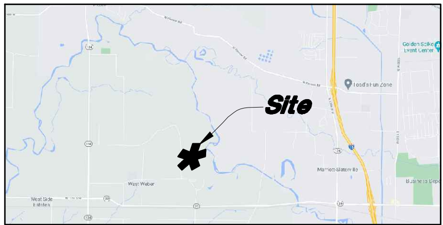
VICINITY MAP Not to Scale