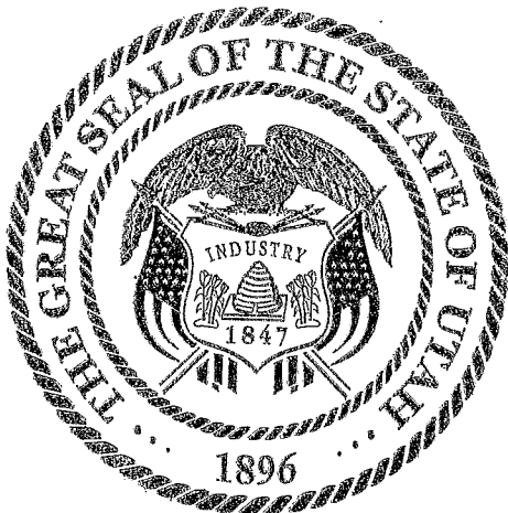
DEIDRE M. HENDERSON Lieutenant Governor

A handwritten signature in cursive script that reads "Deidre M. Henderson".