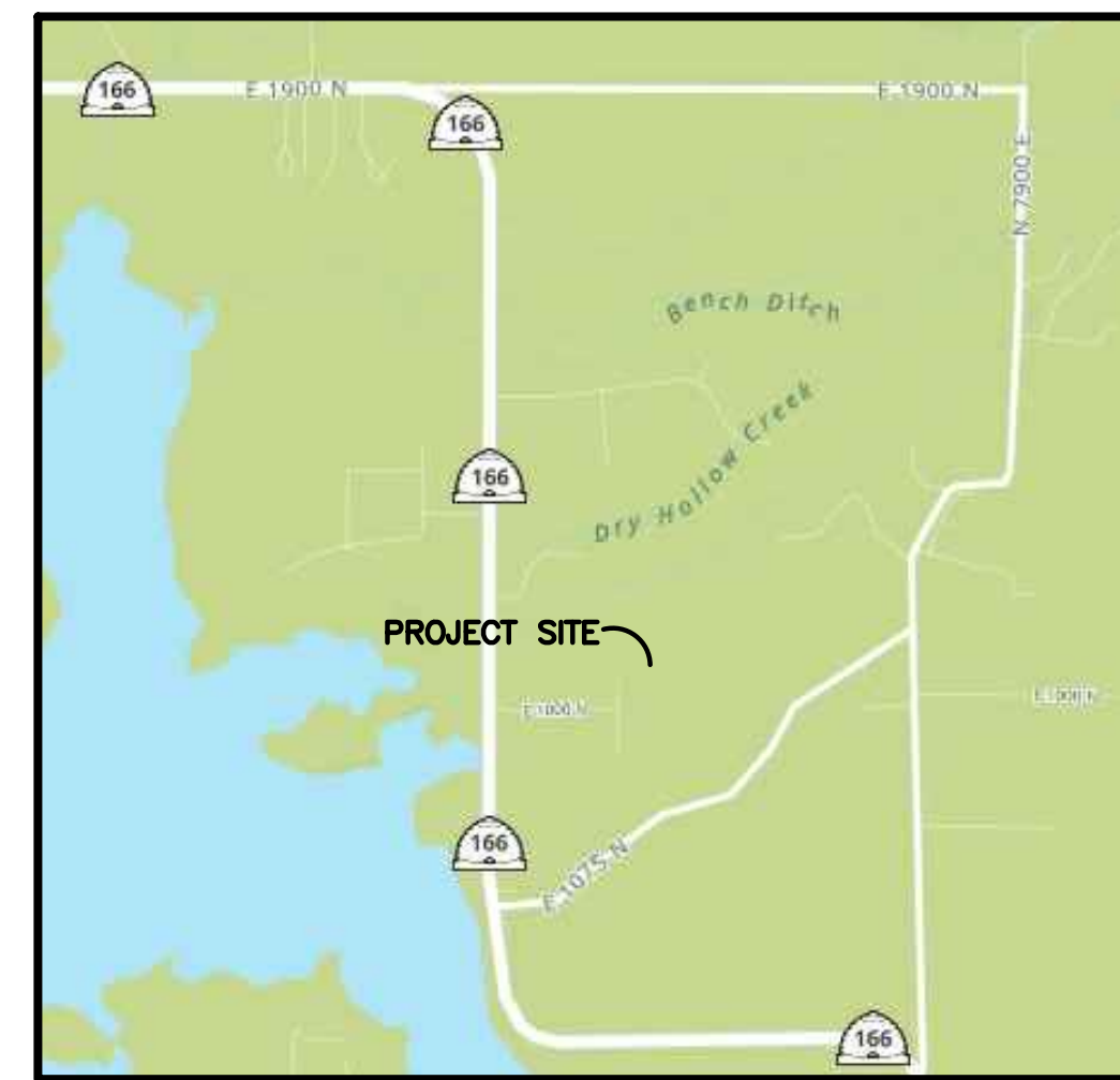
VICINITY MAP SCALE: NONE