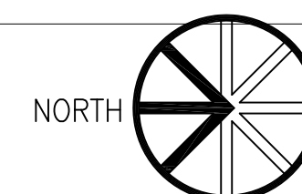
SITE PLAN SCALE 1"=10'-0"