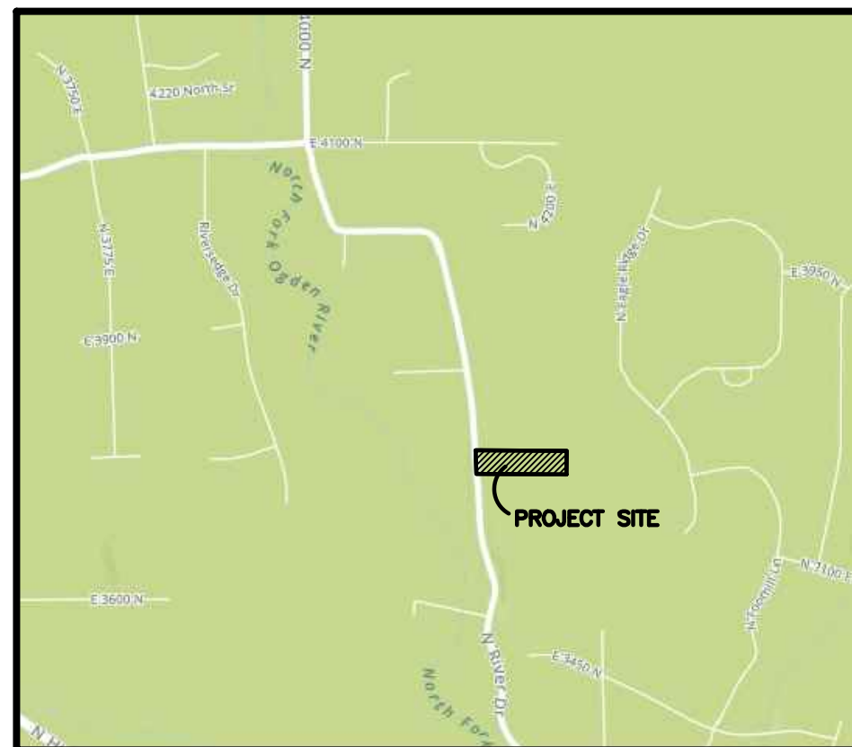
VICINITY MAP SCALE: NONE

PART OF THE SOUTHWEST QUARTER OF SECTION 21, T.7N., R.1E., S.L.B.&M., U.S. SURVEY WEBER COUNTY, UTAH OCTOBER, 2020