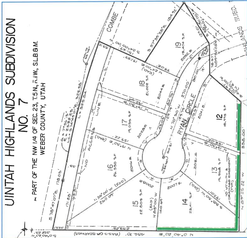
Exhibit A: Easements to be Vacated