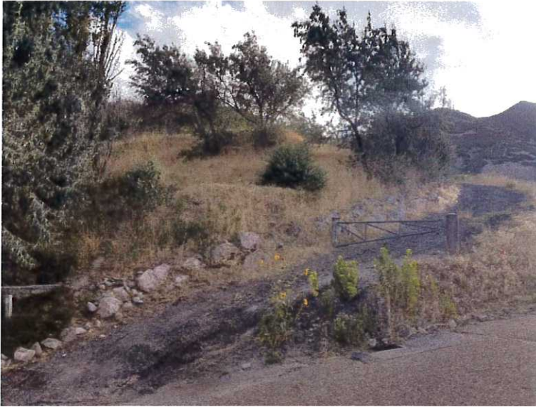
Photo of the existing reservoir site. Taken from Bybee Drive looking east.

Please consider the above explanation for the requested conditional use permit. Below is a photograph of the site looking eastward from Bybee Drive and a portion of the conceptual site plan showing the proposed changes.