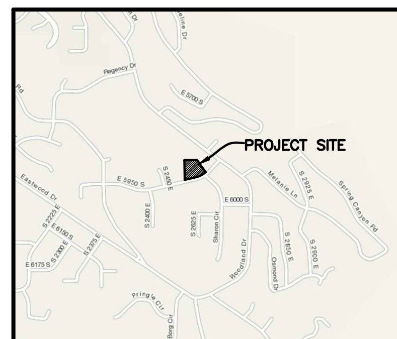
VICINITY MAP NO SCALE