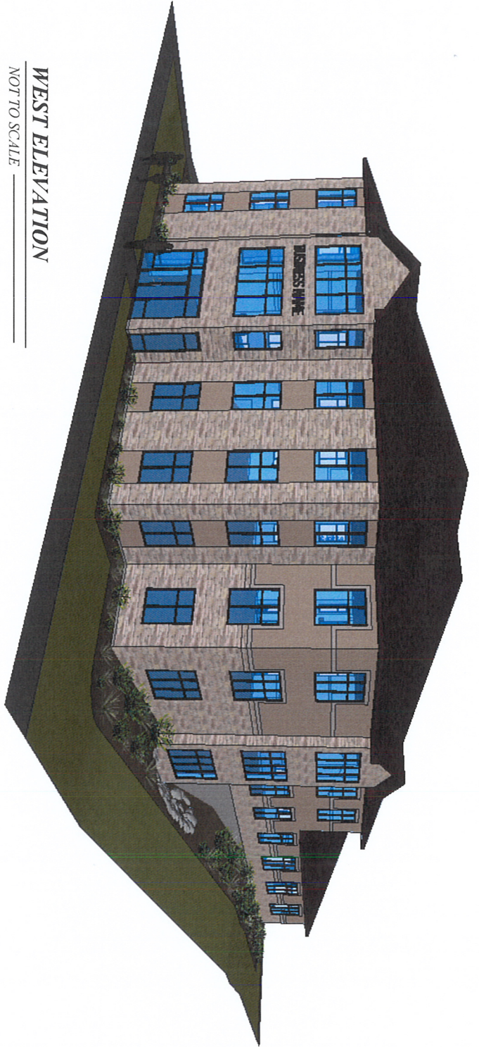
WEST ELEVATION NOT TO SCALE