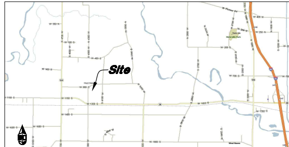
VICINITY MAP Not to Scale