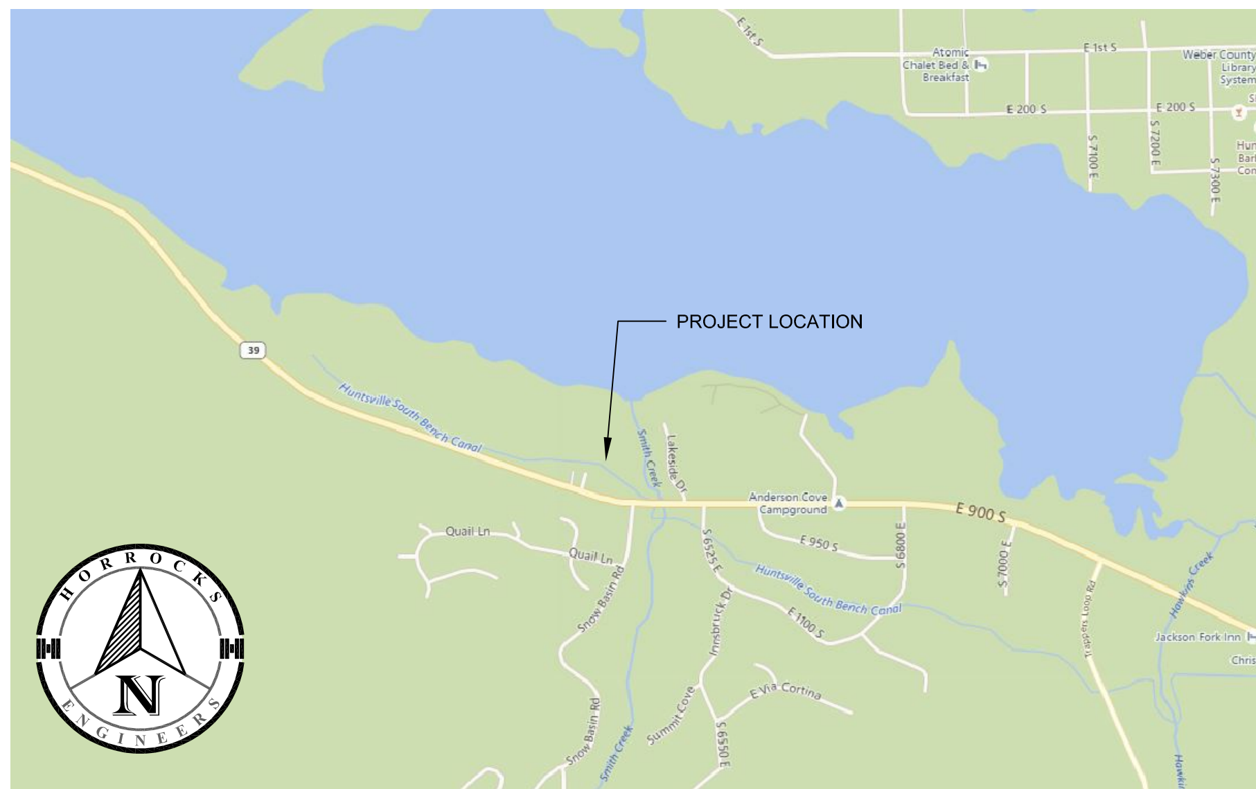
VICINITY MAP NO SCALE

TOTAL AREA .....161,460 S.F. (3.706 ACRES) COMMON AREA ..... 125,240 S.F. (2.875 ACRES) 69% ROAD AREA ..... 26,370 S.F. (0.605 ACRES) OPEN AREA ..... 98,870 S.F. (2.269 ACRES) LIMITED COMMON AREA ..... 4,940 S.F. (0.289 ACRES) 6% PRIVATELY OWNED BUILDING ..... 27,360 S.F. (0.62 ACRES) 23% PUBLIC STREET DEDICATION ..... 3,920 S.F. (0.0899 ACRES) 2%