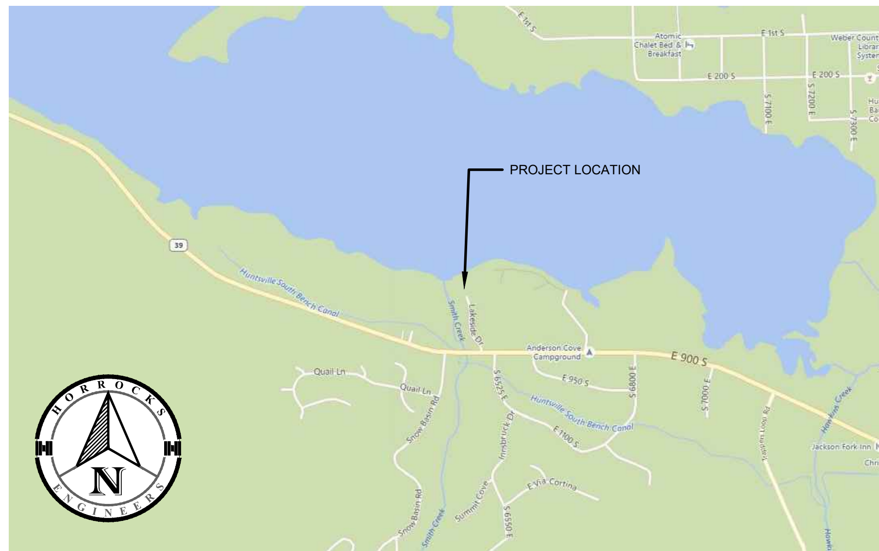
VICINITY MAP NO SCALE