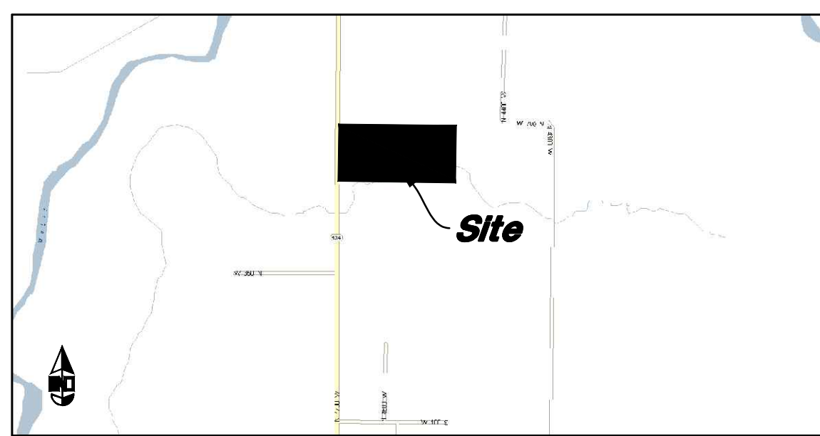
VICINITY MAP Not to Scale

A part of the Southeast 1/4 of Section 8, T6N, R2W, SLB&M, U.S. Survey West Weber City, Weber County, Utah October 2017