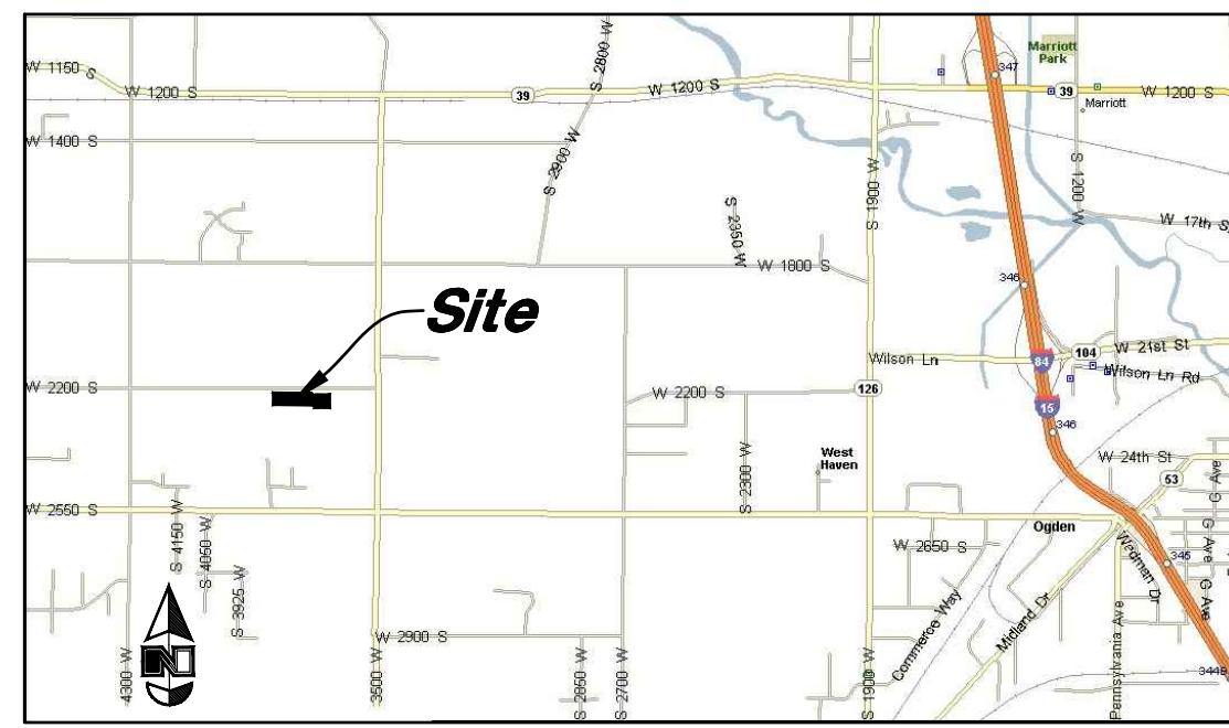
VICINITY MAP (Not to Scale)

A part of the Southeast Quarter of Section 28, T6N, R2W, SLB&M, U.S. Survey Weber County, Utah November 2019