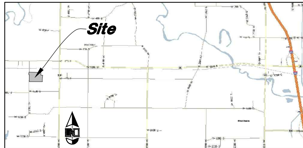
Vicinity Map Not to Scale

A Part of Section 20, Township 6 North, Range 2 West, Salt Lake Base & Meridian, U.S. Survey Weber County, Utah November 2016