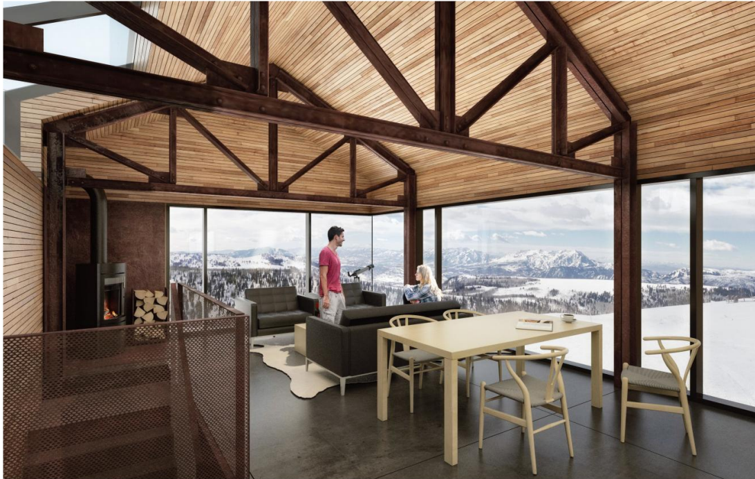
1000sf INTERIOR HORIZONTAL CEDAR BOARDS