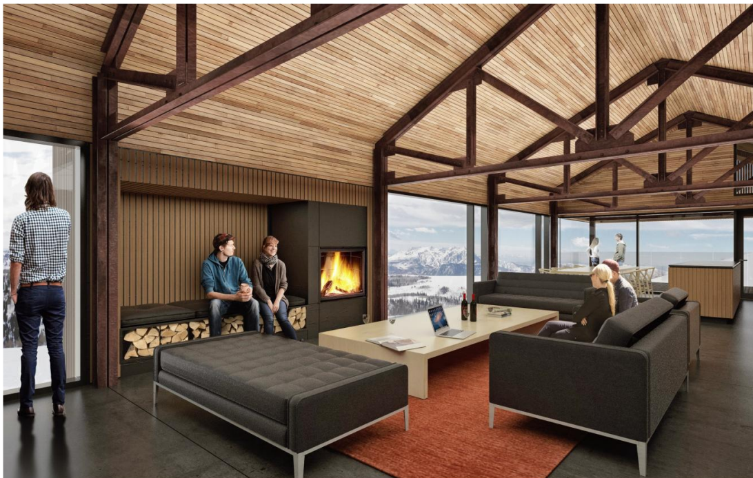
2500sf INTERIOR HORIZONTAL CEDAR BOARDS