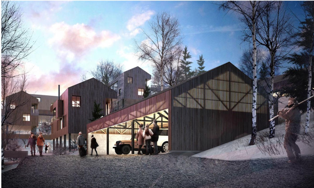
PARKING GARAGE VIEWED FROM THE EAST