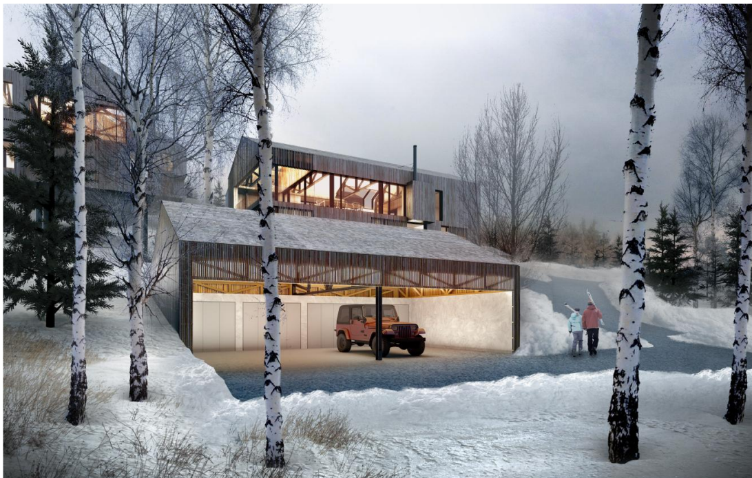
PARKING GARAGE VIEWED FROM THE SOUTH