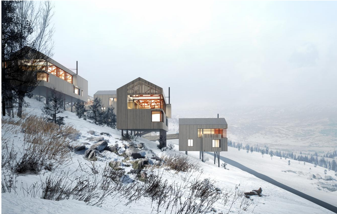
VIEWED FROM THE WEST