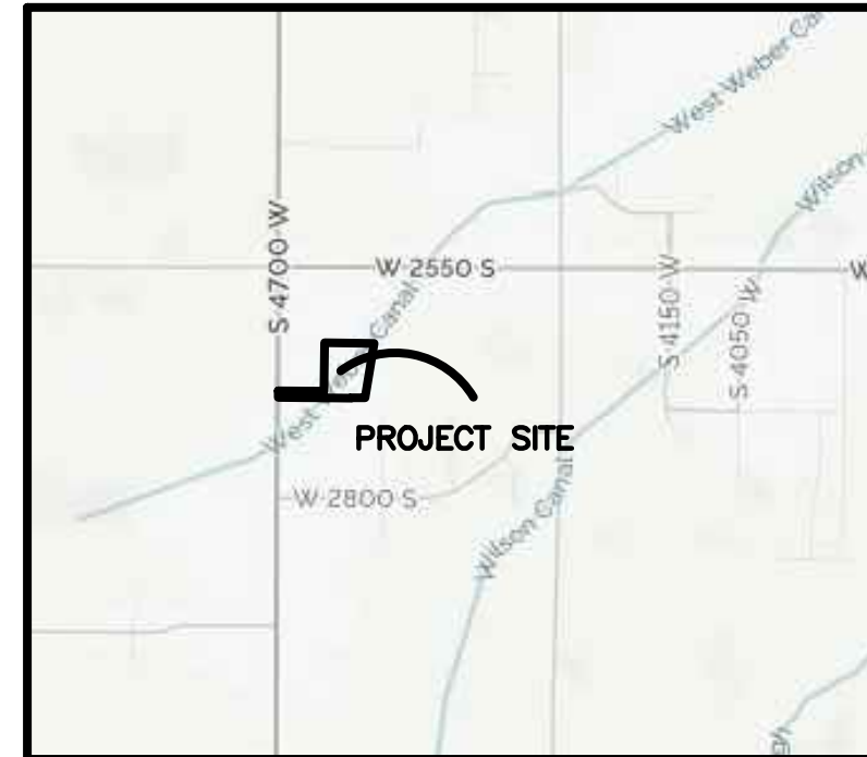
VICINITY MAP (NO SCALE) LEGEND

FOUND MAG NAIL AT THE NORTHEAST CORNER OF SECTION 32, TOWNSHIP 6 NORTH, RANGE 2 WEST, SALT LAKE BASE AND MERIDIAN.