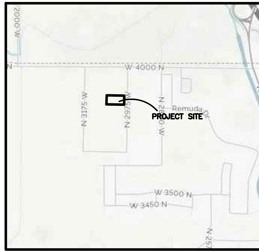
VICINITY MAP (NO SCALE)

PART OF THE NORTHEAST QUARTER OF SECTION 22, T.7N., R.2W., SLB&M, U.S. SURVEY WEBER COUNTY, UTAH JULY, 2016