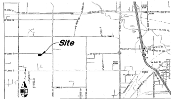
VICINITY MAP (Not to Scale)