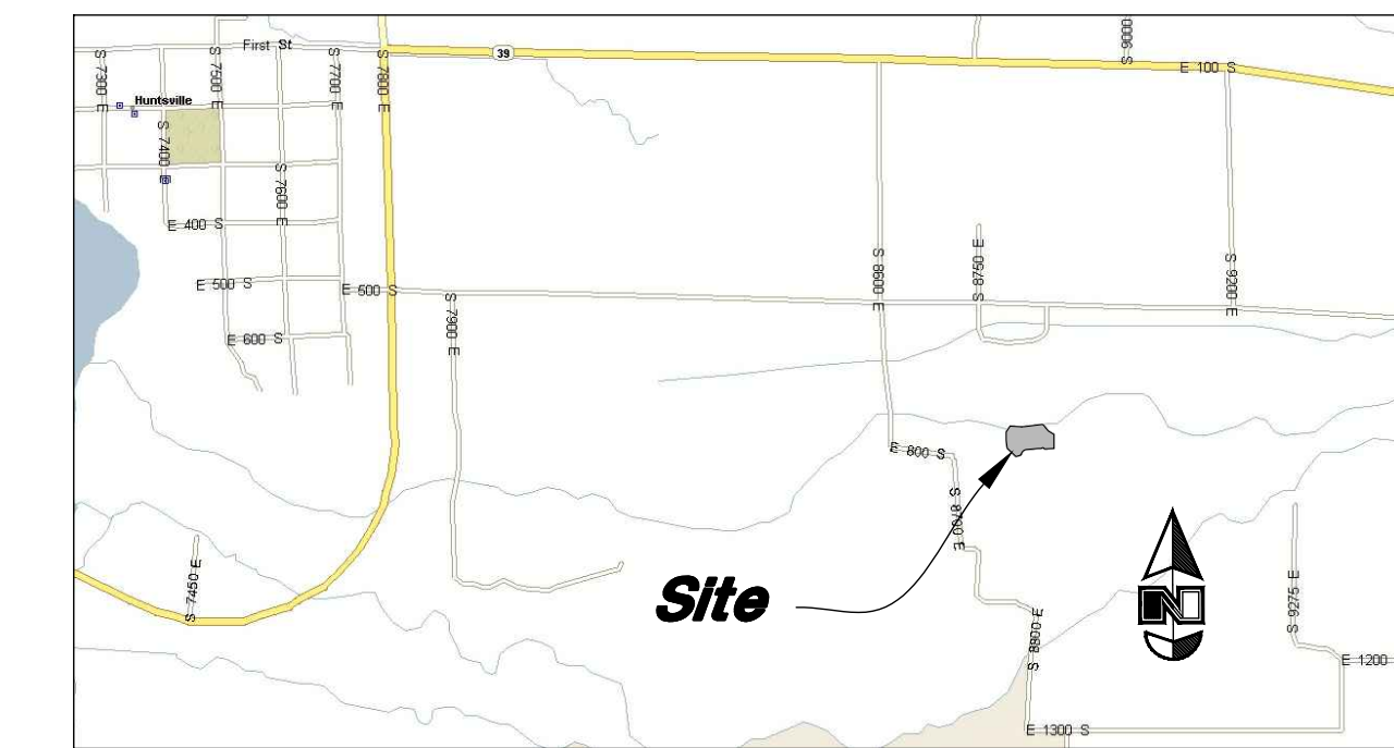
VICINITY MAP Not to Scale

Amending Lot 1 River Ranch A part of the Southwest 1/4 of Section 16 and the Northwest 1/4 of Section 21, T6N, R2E, SLB&M, U.S. Survey Huntsville District, Weber County, Utah September 2015