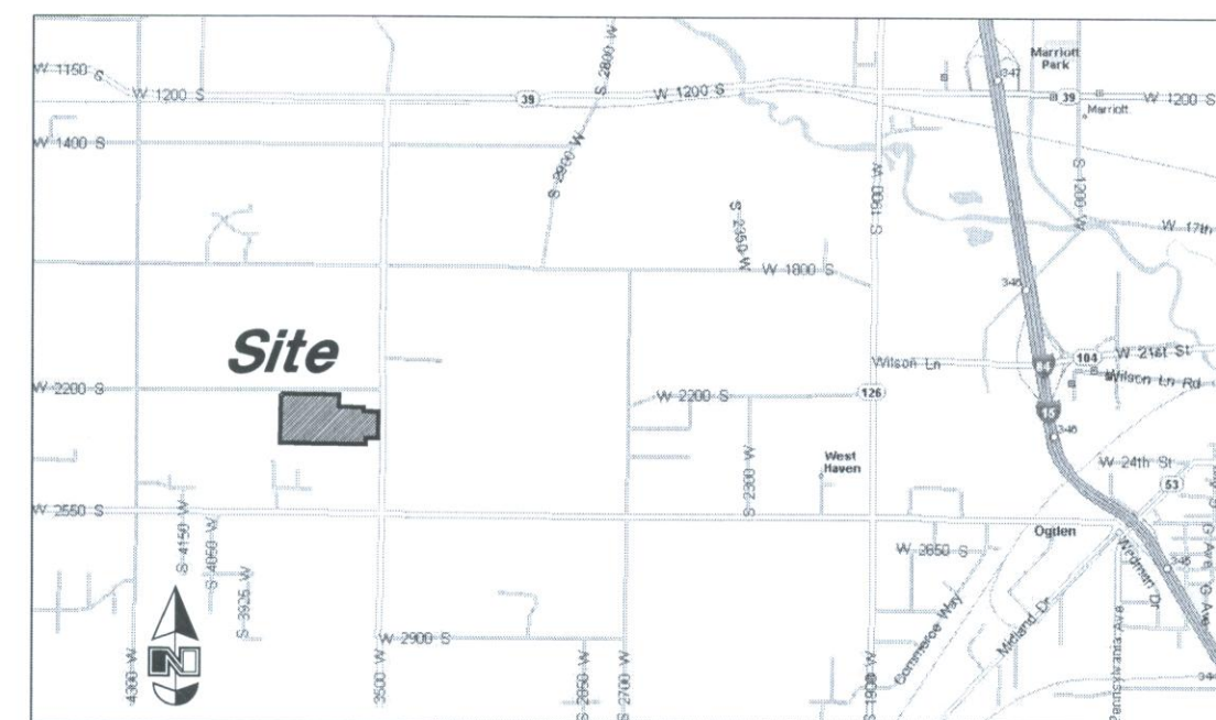
VICINITY MAP (Not to Scale)