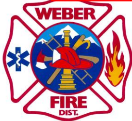
Exhibit C- Fire Approval

2023 W. 1300 N. Farr West, UT 84404 (801) 782-3580 Fax (801) 782-3582