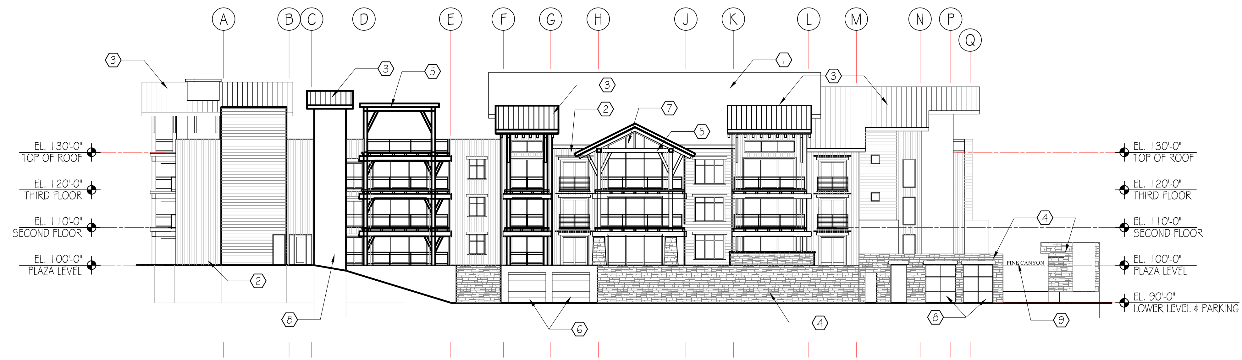
EAST ELEVATION SCALE: 1/8" = 1'-0"