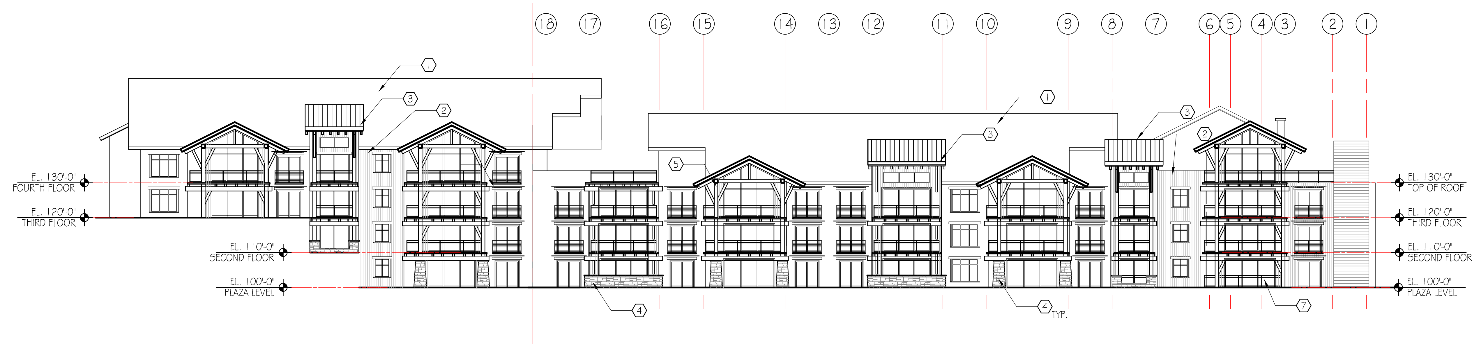
SOUTH ELEVATION SCALE: 1/8" = 1'-0"