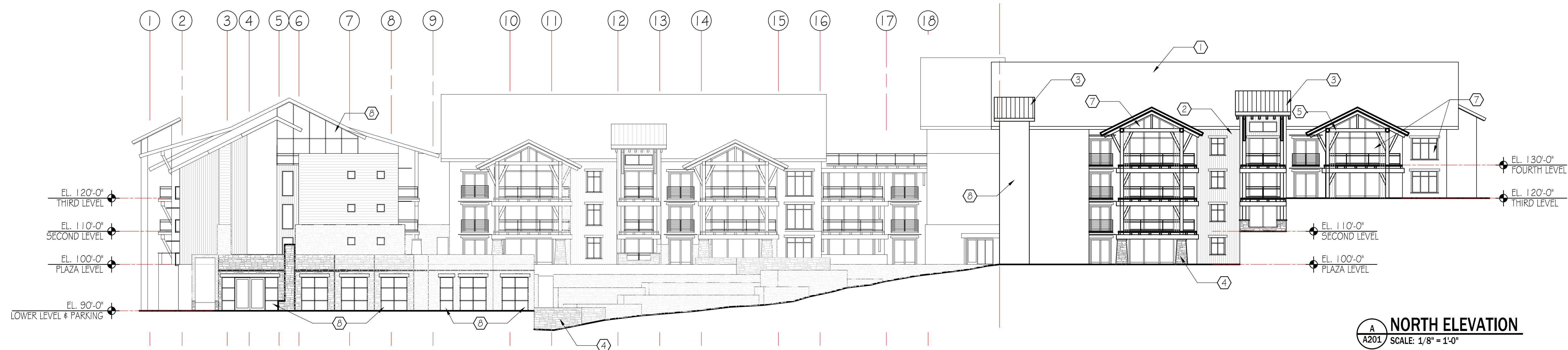
NORTH ELEVATION SCALE: 1/8" = 1'-0"