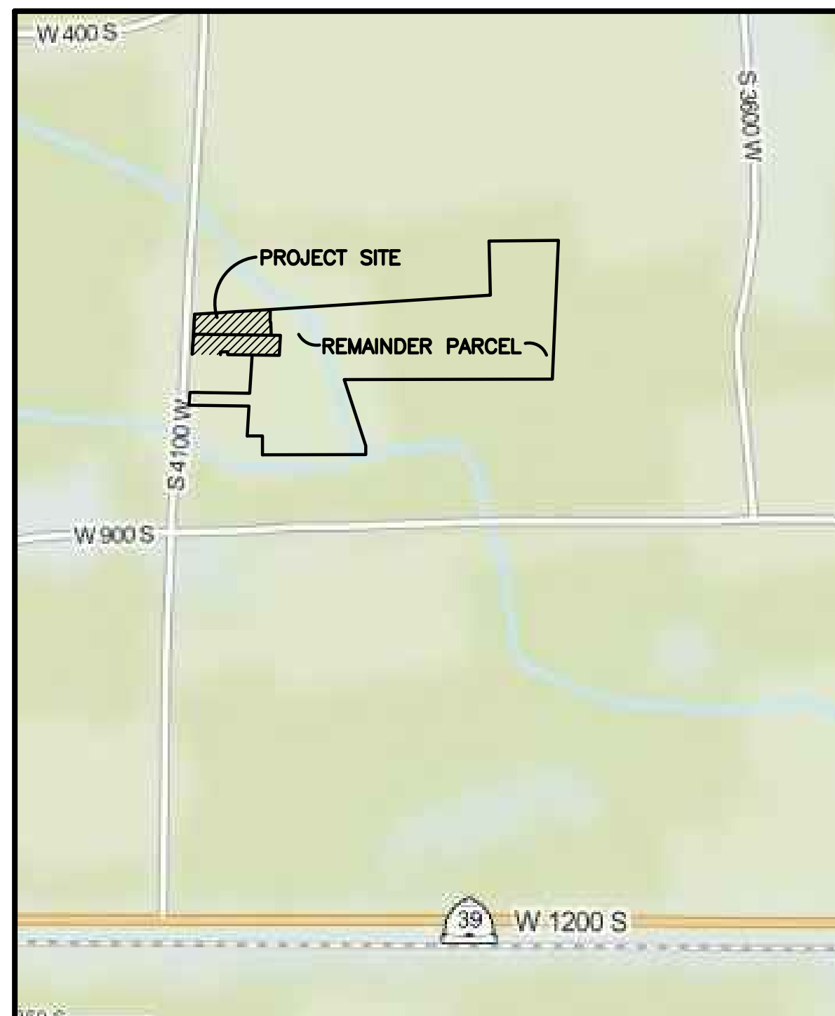
VICINITY MAP SCALE: NONE

CONTAINING 518 SQUARE FEET OR 0.012 ACRE