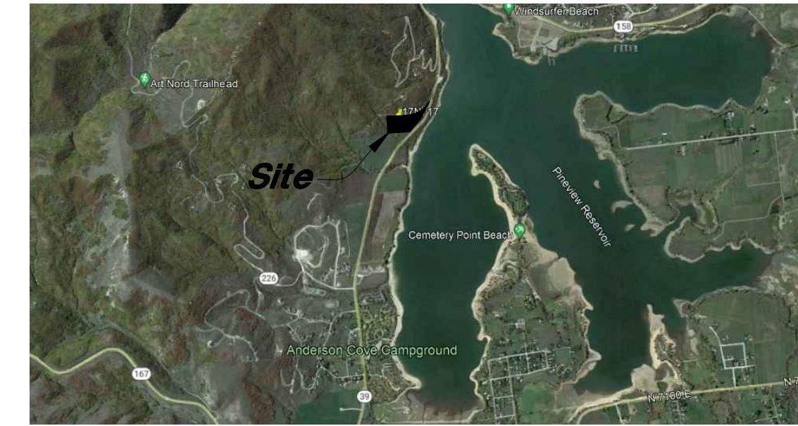
VICINITY MAP Not to Scale