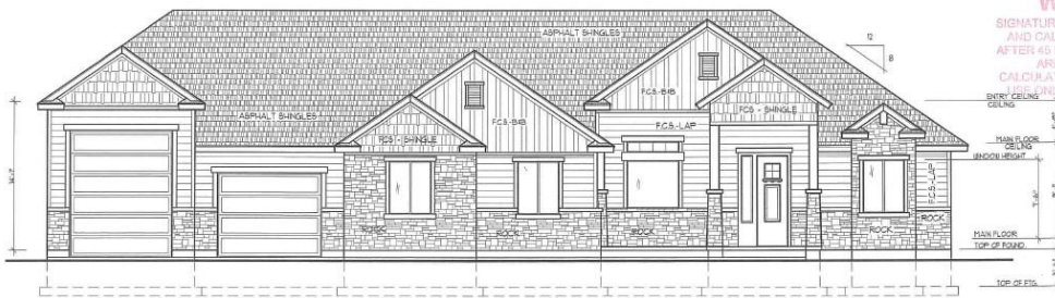
FRONT ELEVATION SCALE 1/8" = 1'-0"

WARNING! SIGNATURE MUST BE IN RED. PLANS AND CALCULATIONS SIGNED AFTER 45 DAYS FROM SIGNED DATE ARE VOID. PLANS AND CALCULATIONS ARE FOR ONE TIME USE ONLY ON DESIGNATED LOT.