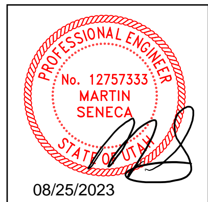
Professional Engineer Seal