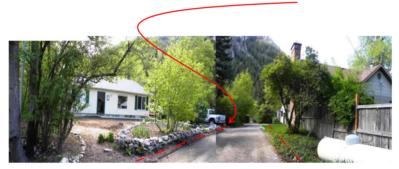
Picture # 2 – This is looking south along the private road. The applicant's dwelling is on the left