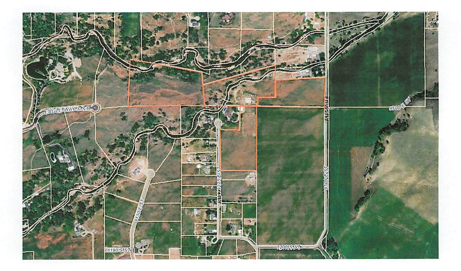
Exhibit A – Subdivision Plat