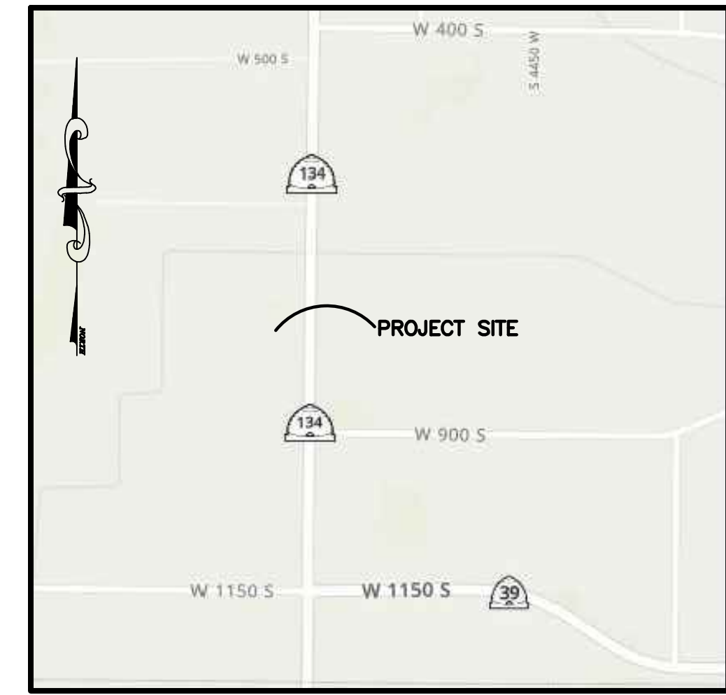
VICINITY MAP SCALE: NONE