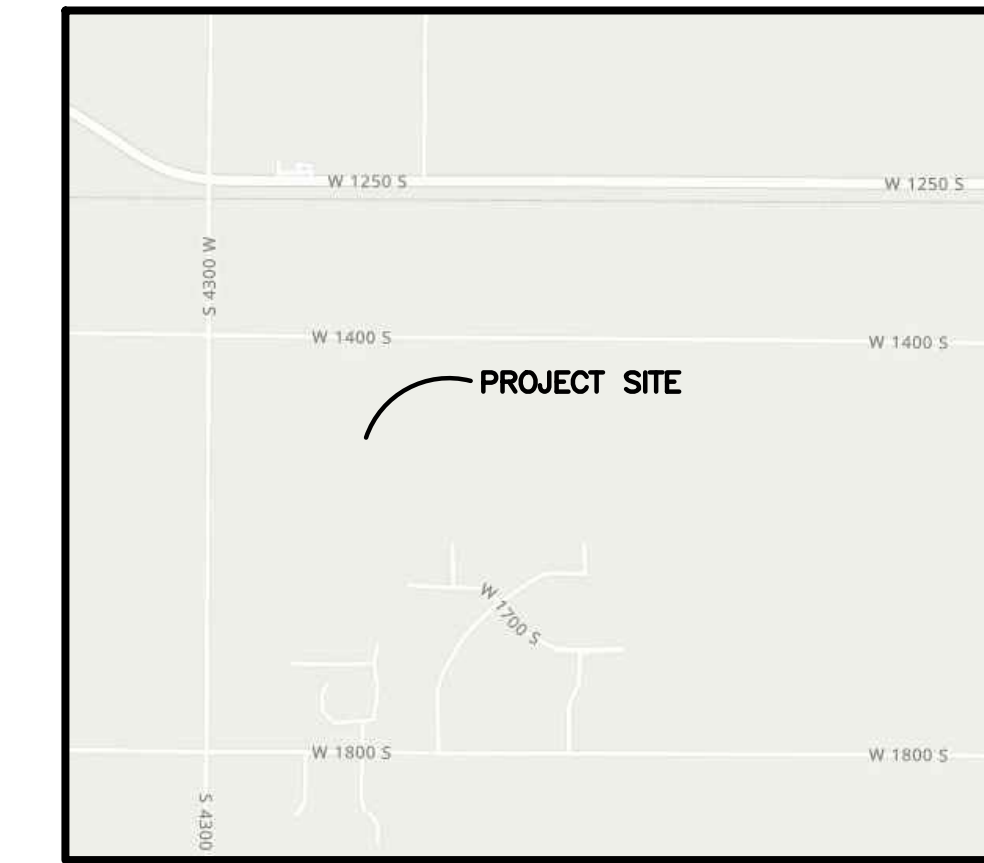
VICINITY MAP SCALE: NONE