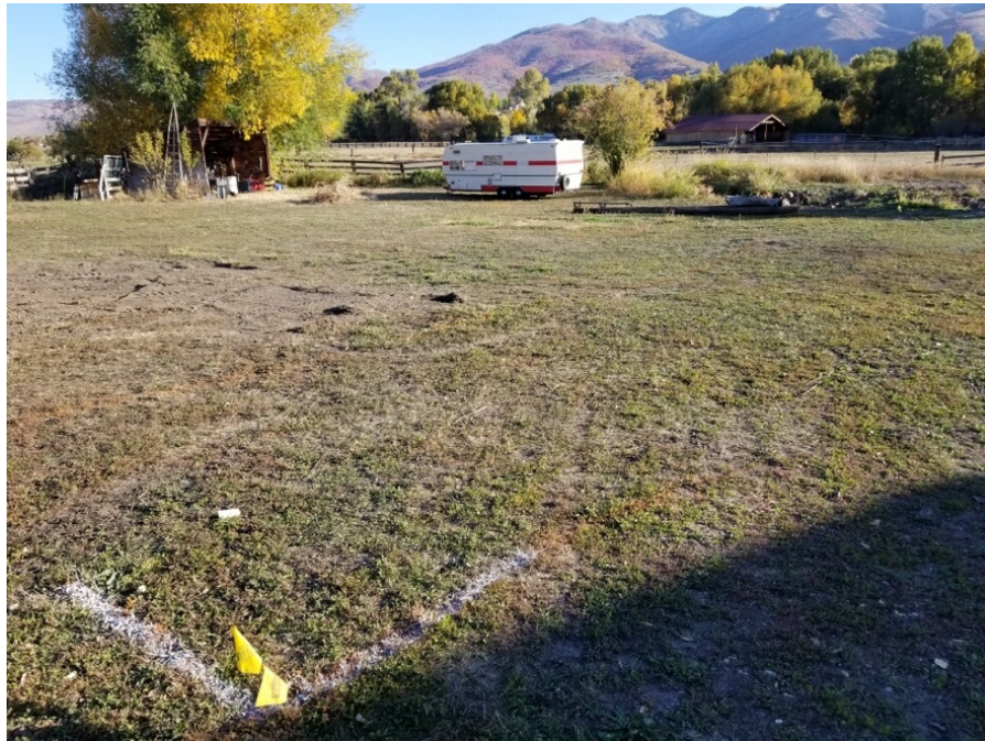
3.) October 2021. Freshly tilled field.