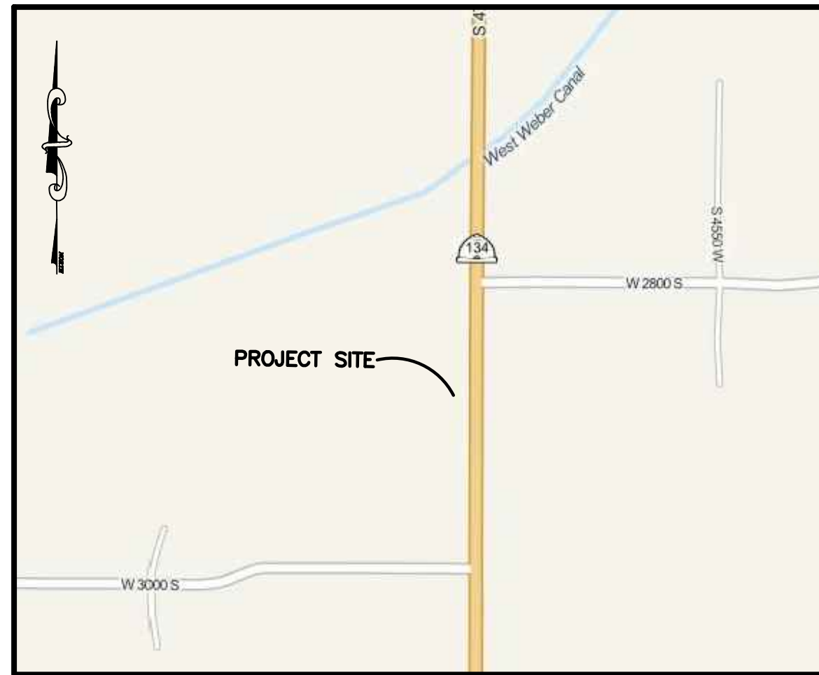
VICINITY MAP SCALE: NONE

PART OF THE NORTHWEST QUARTER OF SECTION 32, TOWNSHIP 6 NORTH, RANGE 2 WEST, SALT LAKE BASE & MERIDIAN, U.S. SURVEY WEBER COUNTY, UTAH SEPTEMBER, 2022