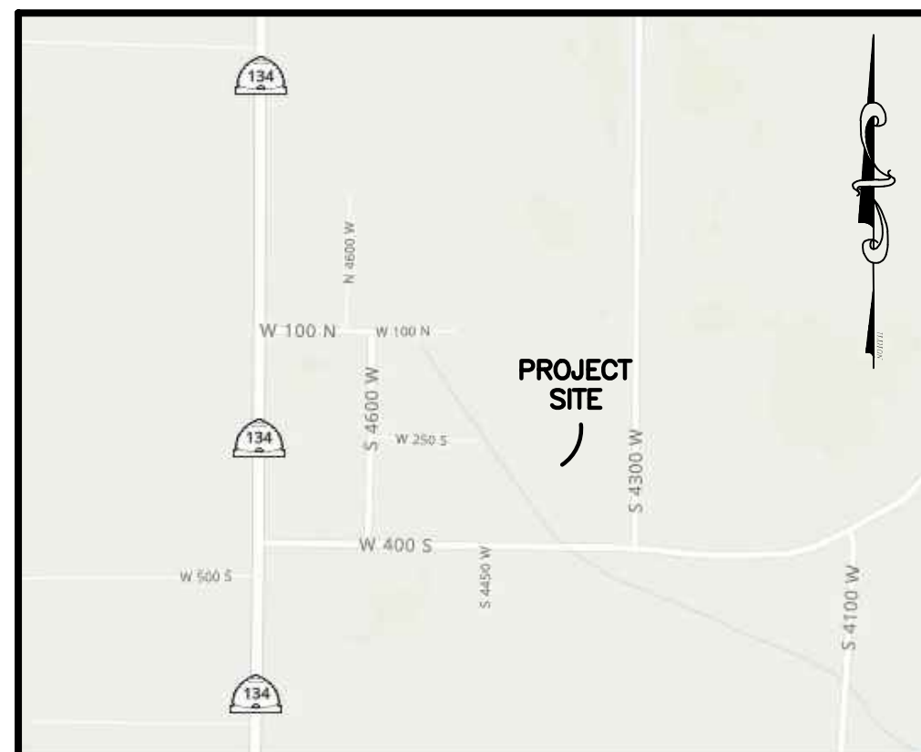
VICINITY MAP SCALE: NONE

PART OF THE NORTHEAST QUARTER OF SECTION 17, TOWNSHIP 6 NORTH, RANGE 2 WEST, SALT LAKE BASE & MERIDIAN, U.S. SURVEY WEBER COUNTY, UTAH DECEMBER, 2021