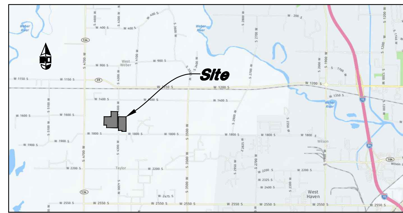
VICINITY MAP Not to Scale