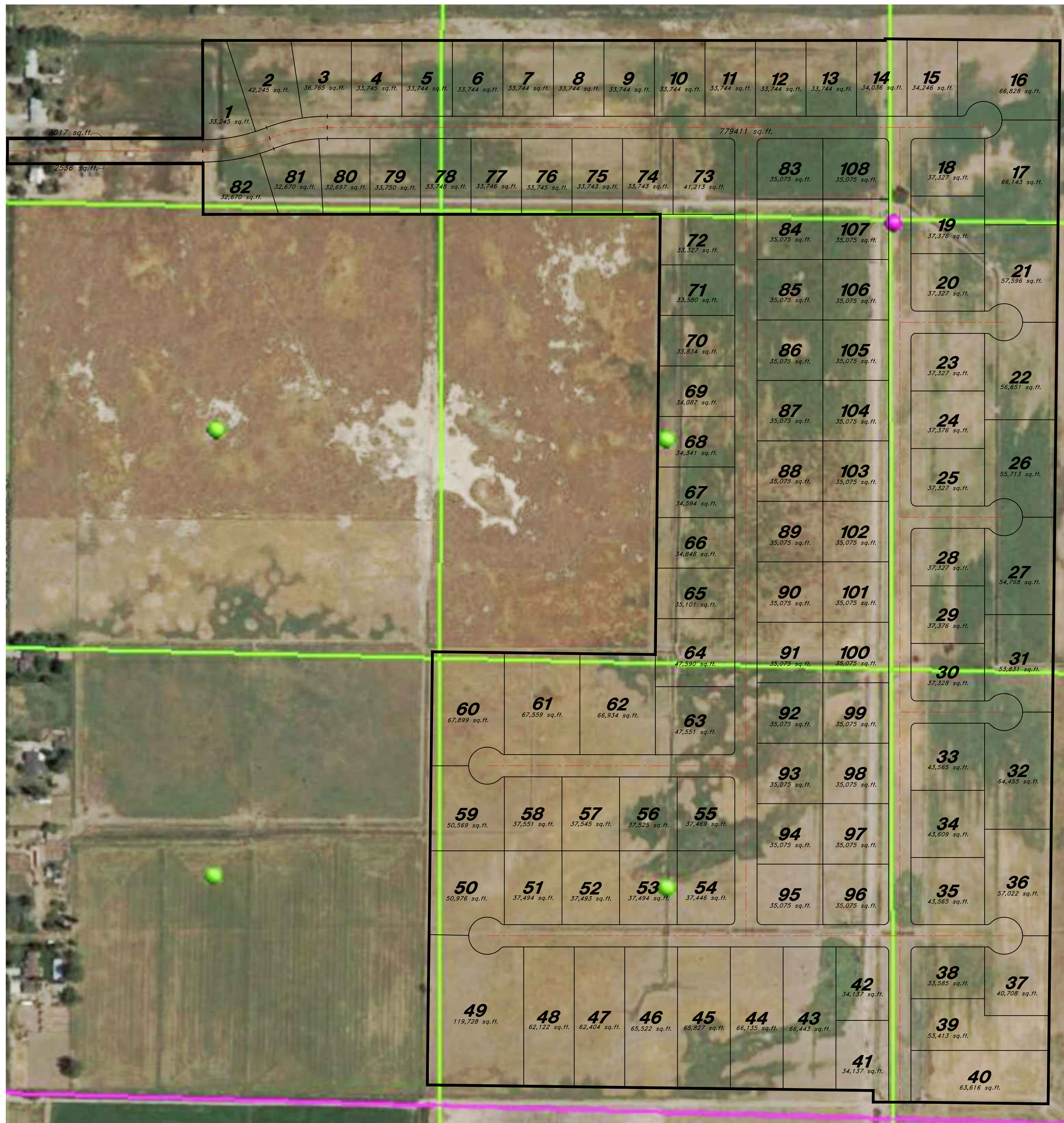
SKETCH PLAN COMPILED USING LOT AVERAGING