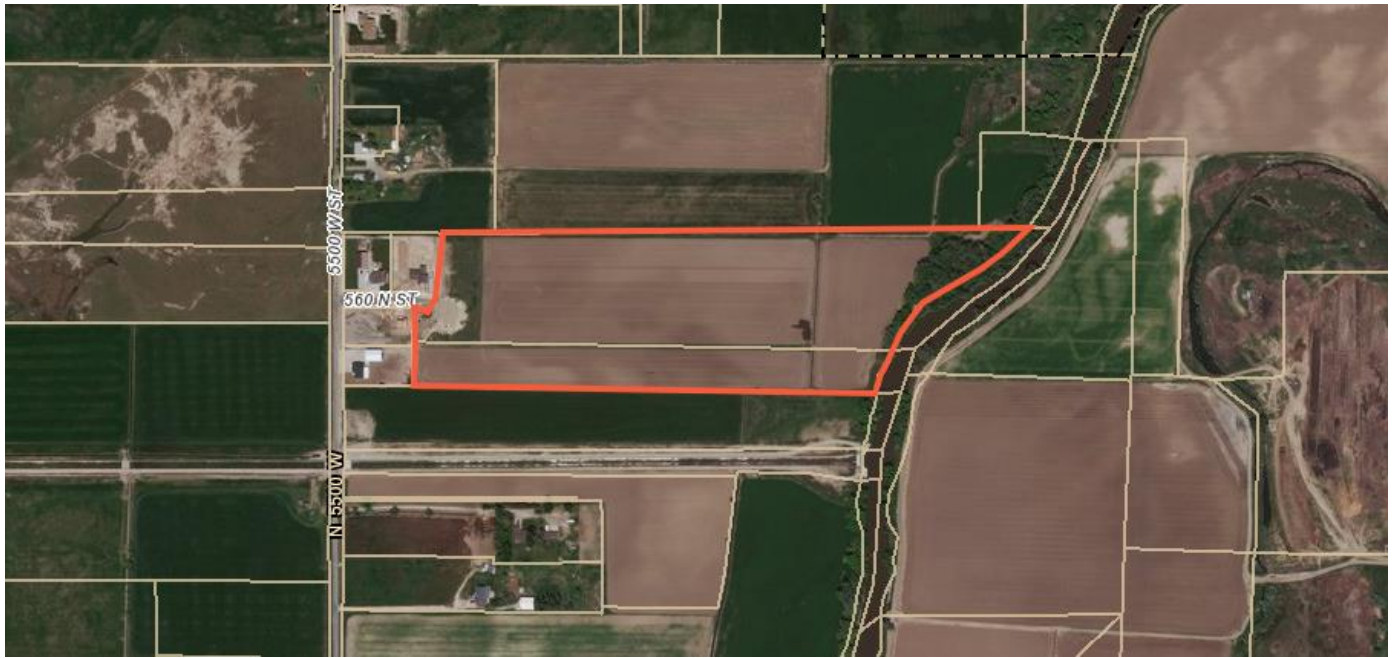
Exhibit A - Subdivision Plat