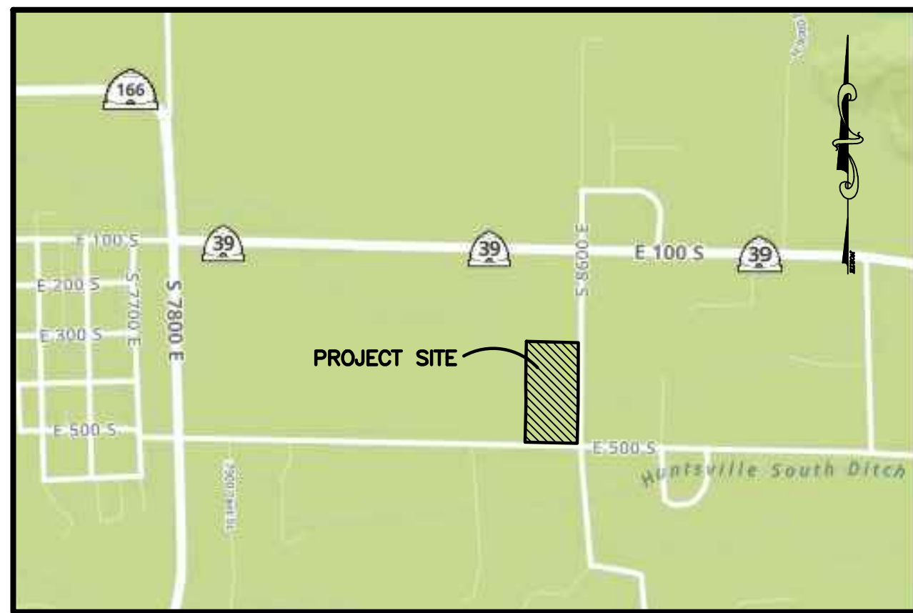
VICINITY MAP SCALE: NONE