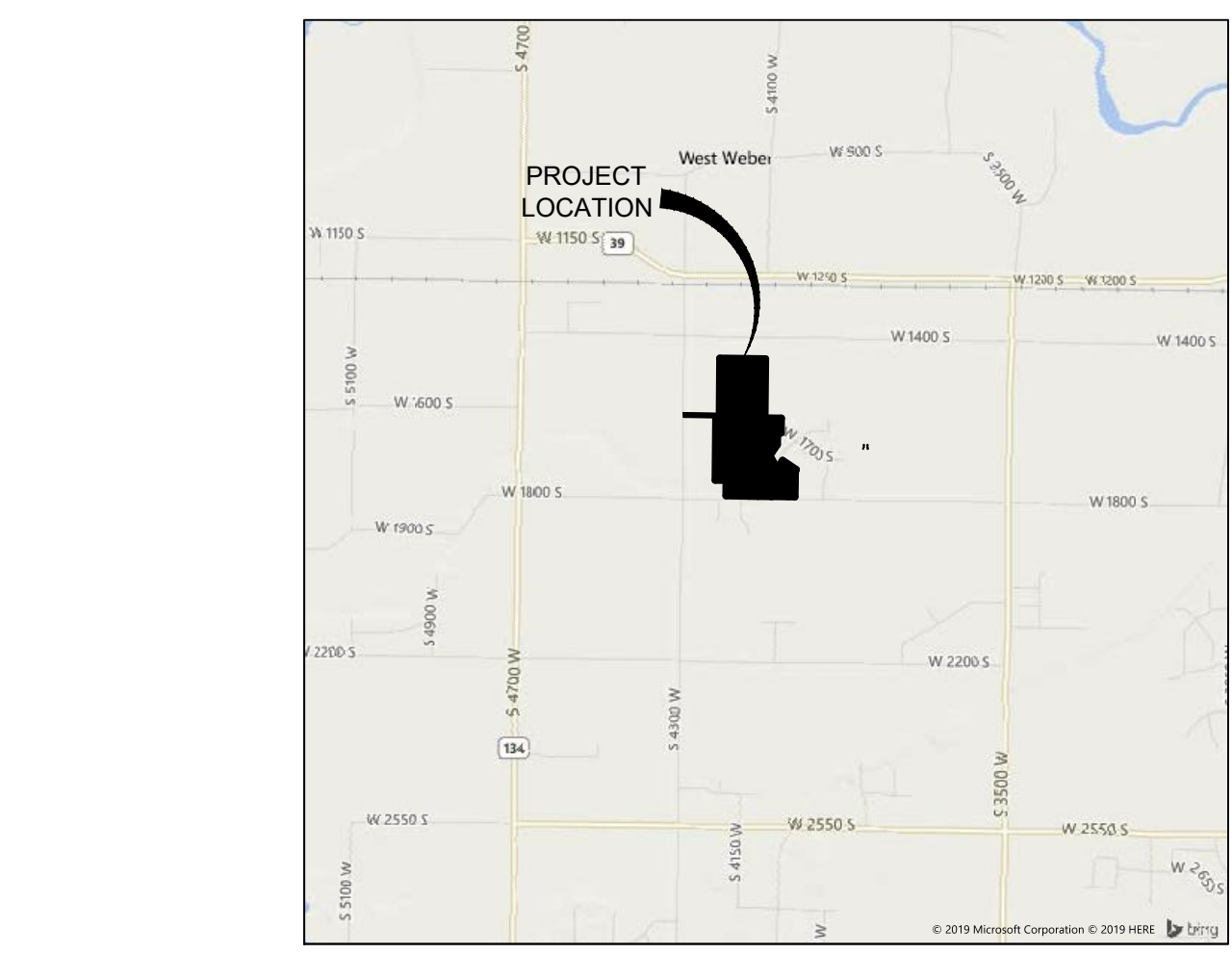
VICINITY MAP N.T.S.