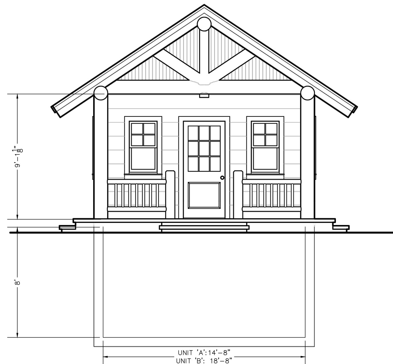
① Front Entry Elevation (Log Veneer)

A PART OF THE NORTHWEST 1/4 OF SECTION 34, TOWNSHIP 7 NORTH, RANGE 1 EAST, SLB&M, U.S. SURVEY WEBER COUNTY, UTAH JUNE 2012