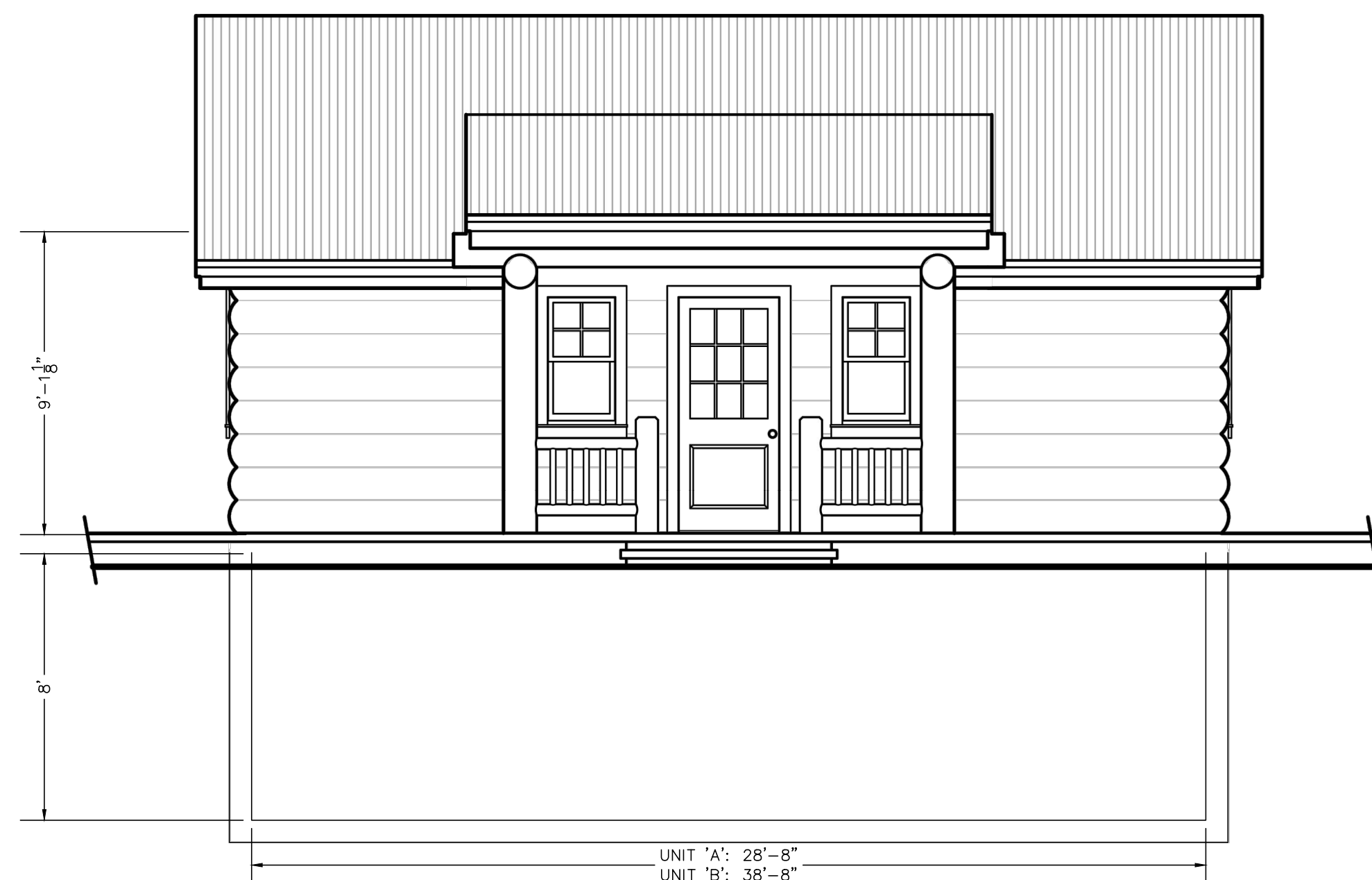
① Side Entry Elevation (Log Veneer)