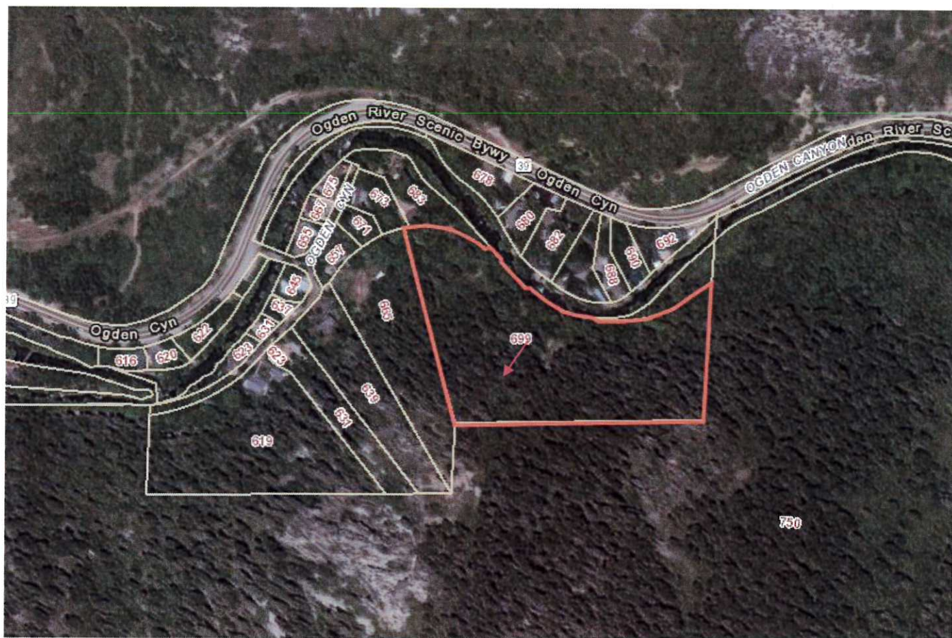
Exhibit A-Location map and Current Parcel Arrangement