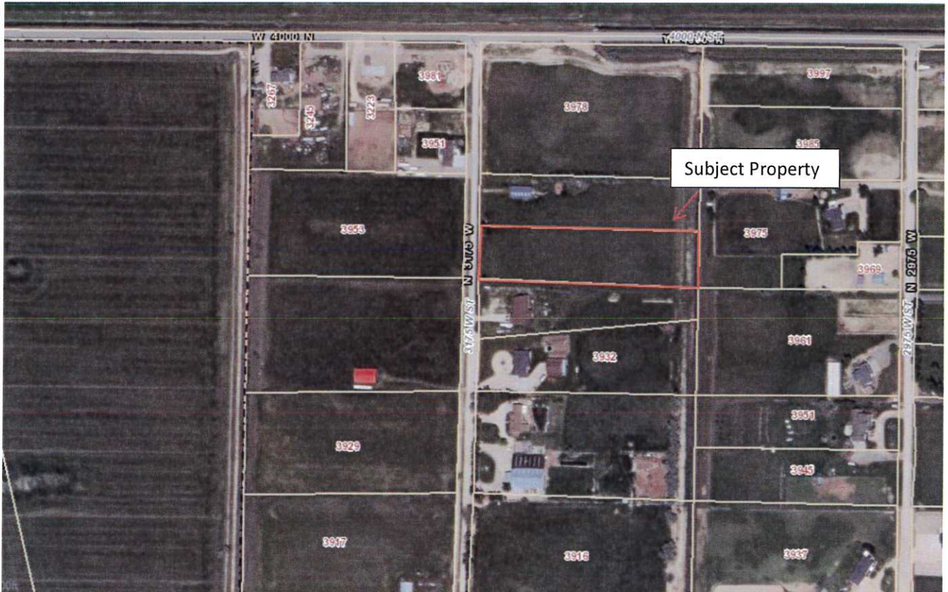
Exhibit A-Location map