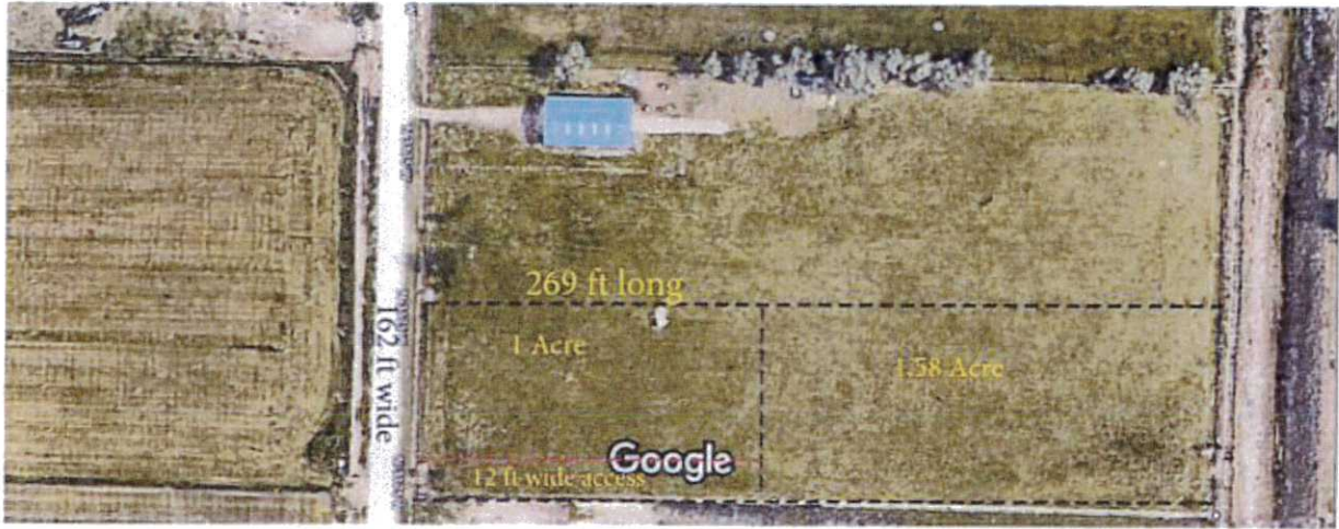
Exhibit C-Site Plan