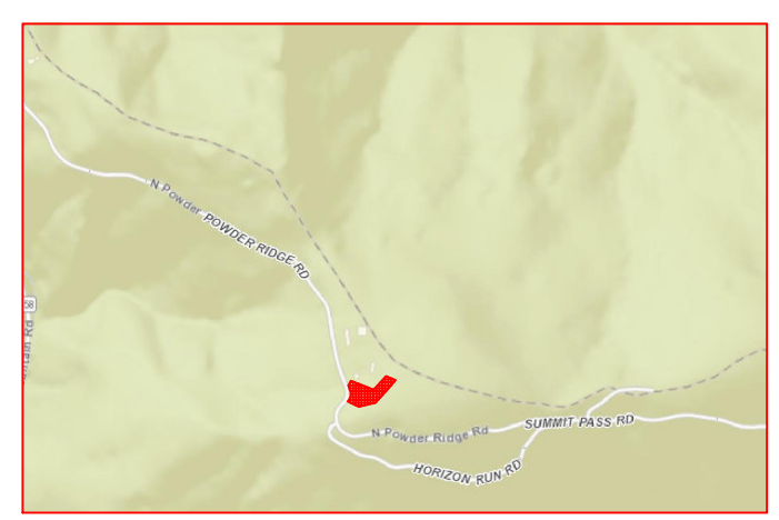
1. Due to the topography and the location of this subdivision, all owners will accept responsibility for any storm water runoff from the road adjacent to this property until