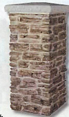
Main Pillar Section

21" x 21" x 46" high (Add 10 1/2" for pyramid cap and 4" for flat cap)