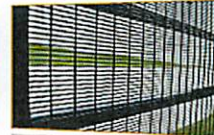
Specs & Drawings